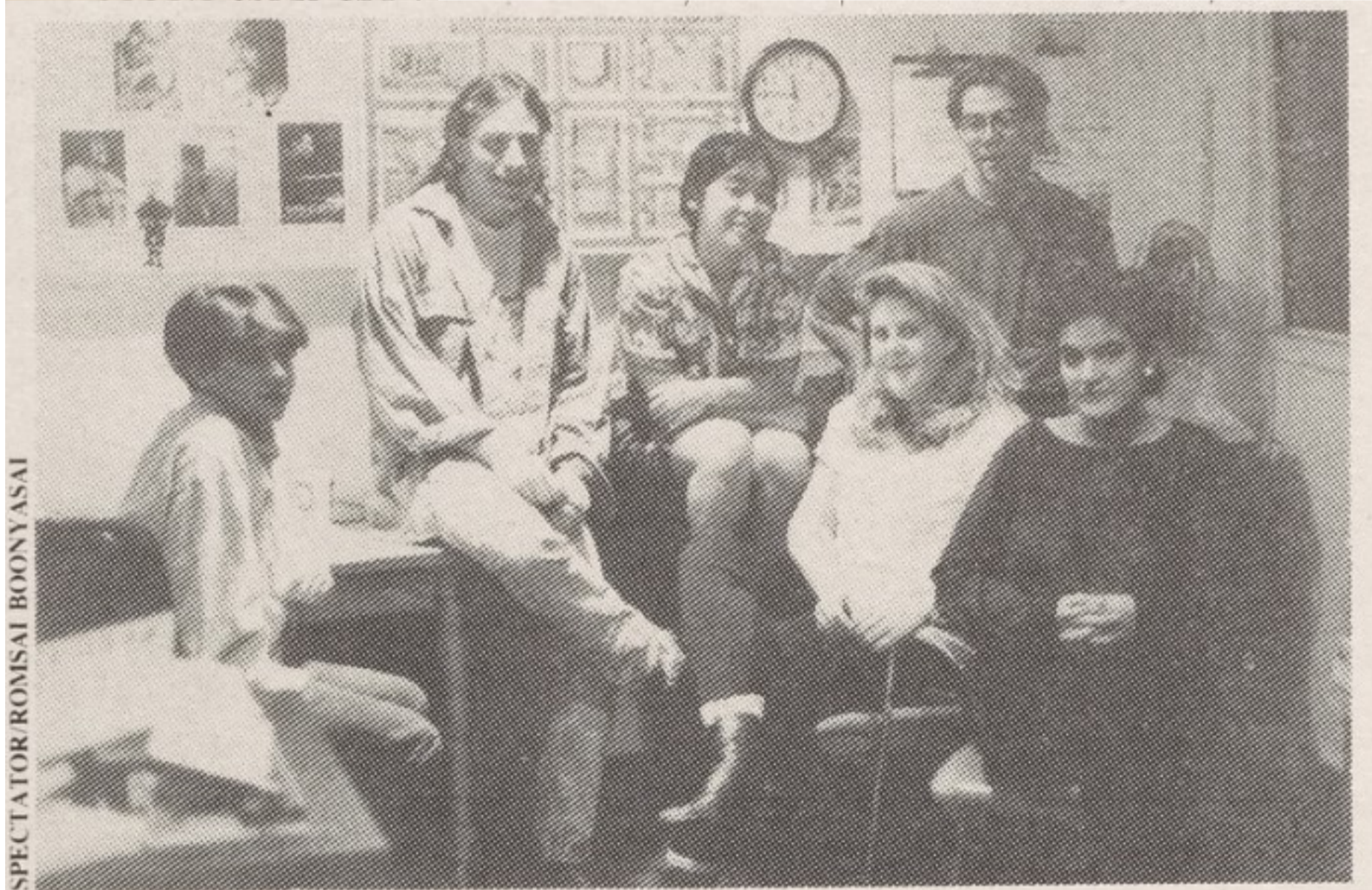
The staff of WKCR's new show, Gender Neutral